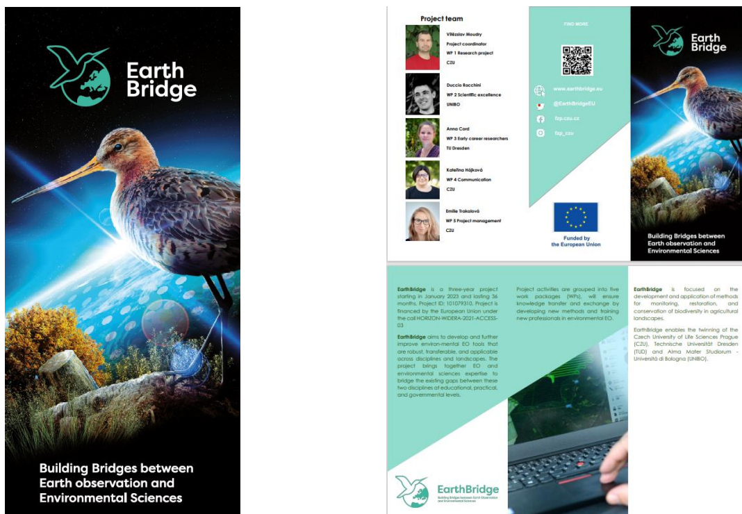
FIGURE 8 EXAMPLES OF DISSEMINATION MATERIALS - EARTHBRIDGE ROLL UP, LEAFLETS

Katerina Hajkova (WP 4 leader) presented briefly about the communication and dissemination activities. During the last six months, the logo manual, leaflets, poster, and other dissemination materials have been created and shared via MS TEAMS. The participants are encouraged to use the templates and other materials as much as possible to further promote the project. The partners distributed three rollups for use during the conferences, etc. All information is included in the "Initial Plan for the communication, dissemination, and exploitation," submitted on 30 th June 2023 and distributed to the EarthBridge members in early July.